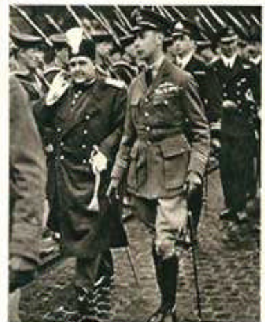
JUST AFTER LEAVING AT DAVEN: THE SHAH WITH PRINCE ALBERT, INSPECTING A BATTAL OF SOLDIERS.